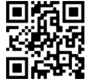
Quick Reference Guide