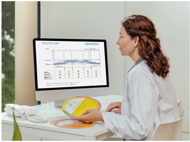
Image is for illustrative purposes only. Not real healthcare professional or data.

Maiorino MI, et al. Effects of continuous glucose monitoring on metrics of glycemic control in diabetes: A systematic review with meta-analysis of randomized controlled trials. Diabetes Care . 2020;43(5):1146-1156