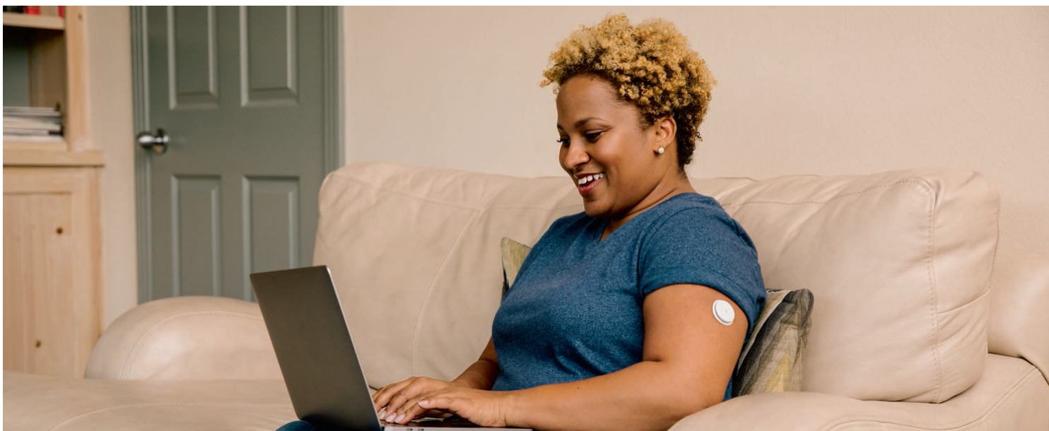
Image for illustrative purposes only. Not real patient.

*The LibreView data management software is intended for use both by patients and healthcare professionals to assist people with diabetes and their healthcare professionals in the review, analysis and evaluation of historical glucose device data to support effective diabetes management. The LibreView software is not intended to provide treatment decisions or to be used as a substitute for professional healthcare advice.