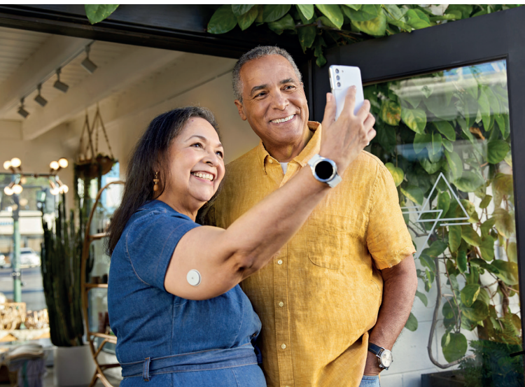
Image for illustrative purposes only. Not real patient.